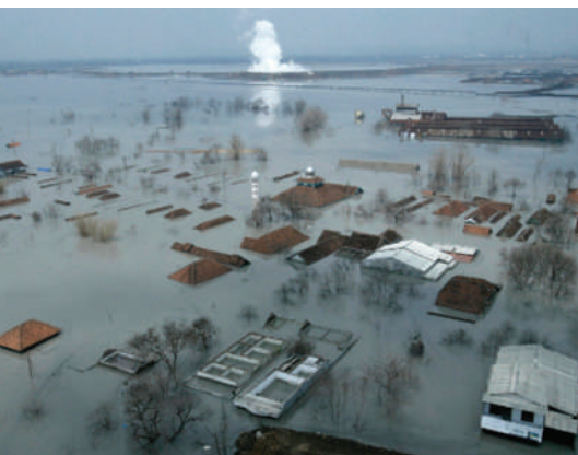
The Sidoarjo mud volcano has caused widespread devastation.

Mud has been spewing from a former rice paddy in Sidoarjo in East Java since 29 May